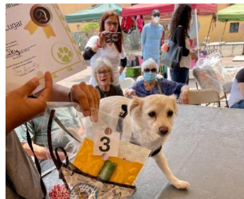
3 rd Place, Sky