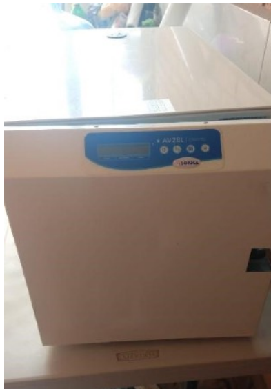
Our autoclave, used to sterilize surgical instruments and drapes

preventing the problem of unwanted litters by offering sterilization services and educating pet owners about their responsibilities toward pets.