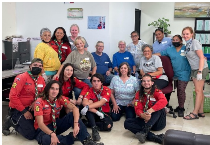
Volunteers posed for a group photo after the campaign