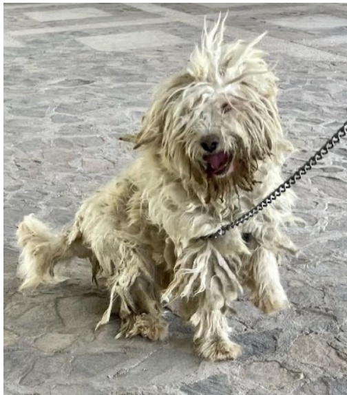
Dog in need of attention in Campuzano

The Campuzano campaign was disappointing because of the low turnout. But our team discovered a badly neglected dog (sterilized at a previous campaign there) and gave him a haircut with his owner's permission.