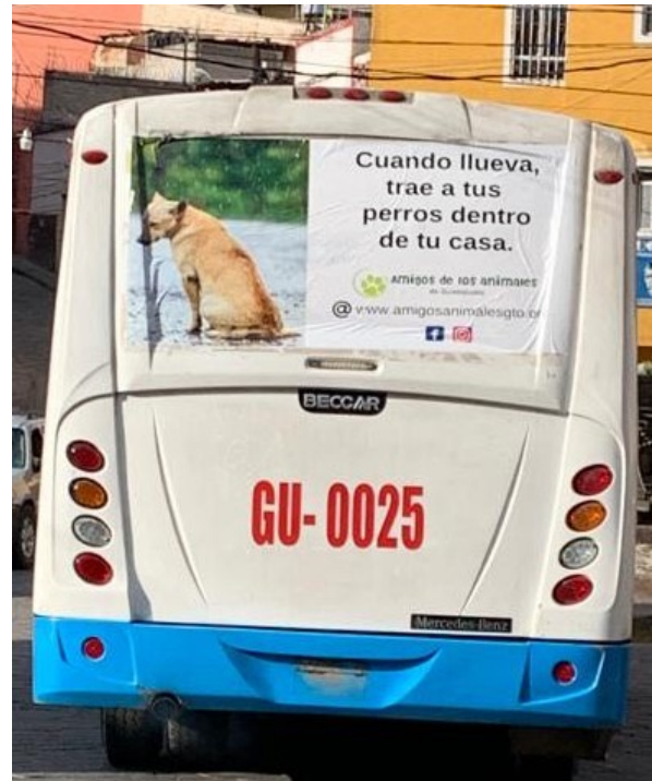
“When it rains, bring your dogs inside your house.”