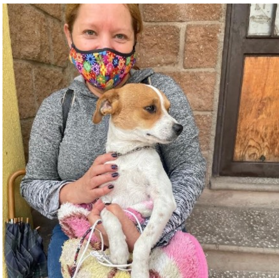
One of 36 dogs with her owner