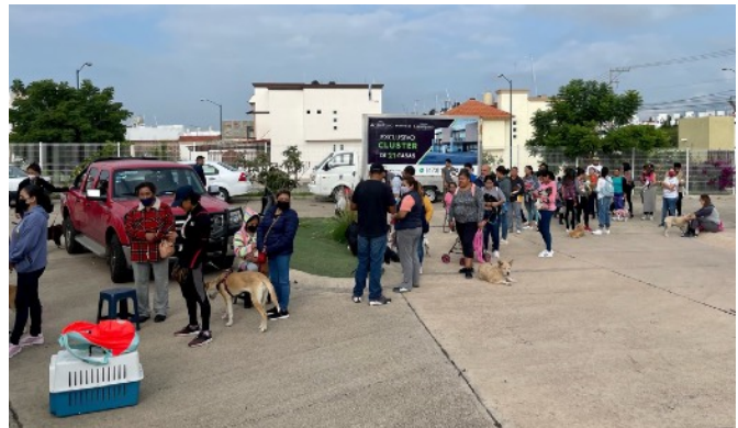
Waiting to register, Villas de Guanajuato