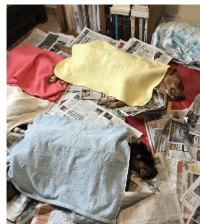
Dogs in the recovery area