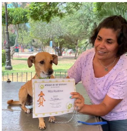
Princesa, winner in the noisiest dog category

products, and the opportunity to connect with other people who love animals.