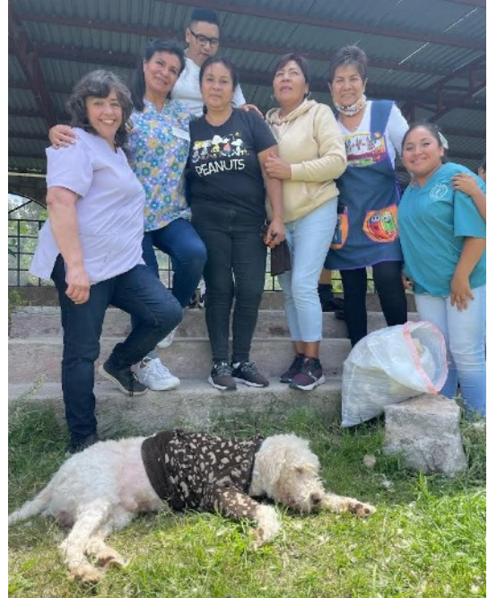
Well done, team!