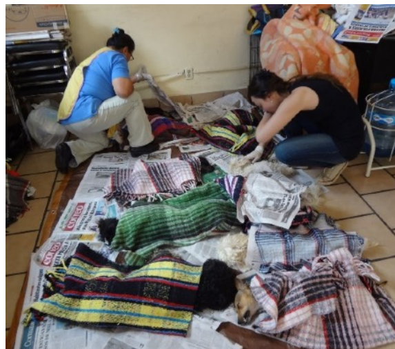
Volunteers checking on animals in the recovery unit