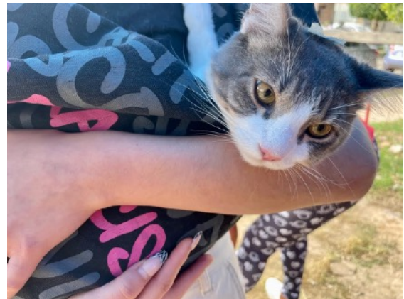
One of 15 cats that day