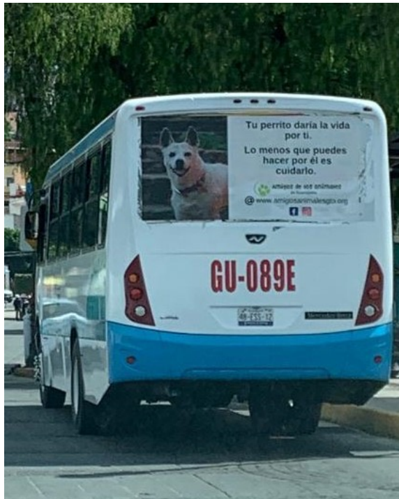
“Your dog would give his life for you. The least you can do for him is to take care of him.”

In July two new messages appeared two city buses. As summer is the rainy season in Guanajuato, one message urges people to bring their dogs indoors when it rains. The other asserts that dogs are extremely loyal and deserve to be treated well. The messages, which will remain on the buses through September, are seen by thousands of people each day.