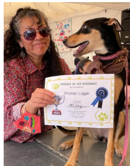
1 st Place, Missy

Naturally, the winner in the noisiest category—the dog that barked most ferociously—was one of the smallest. And she was one of the lucky dogs adopted during the event!