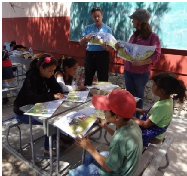
Reading a story to children

If you have teaching experience, we can use your help with a community education program for children. Fluency in Spanish is desirable but not necessary. To learn more, contact us at amigos@amigosanimalesgto.org .