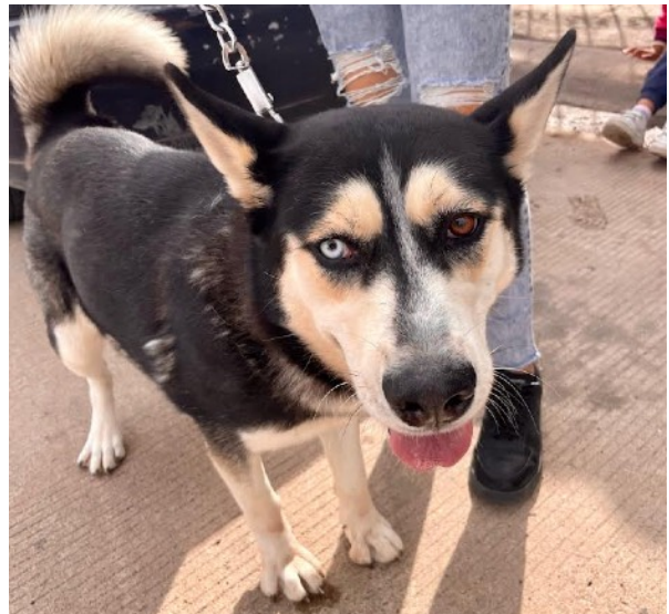
Thirteen dogs were males